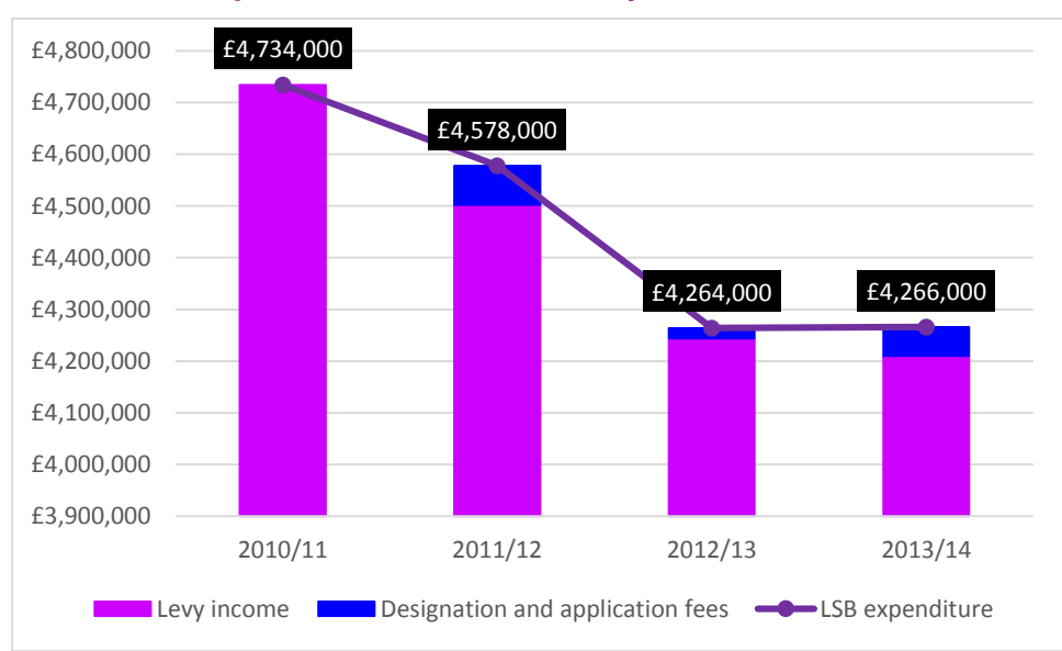
Chart C1 - Expenditure relative to levy income and other income