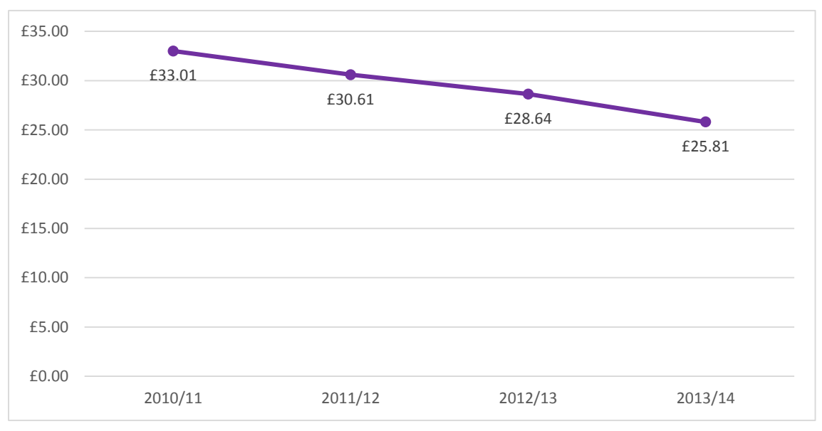
Chart B1 - Levy cost of LSB to authorised individuals