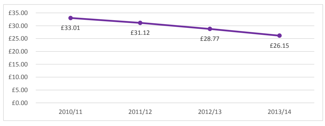
Chart E1 - Unit cost